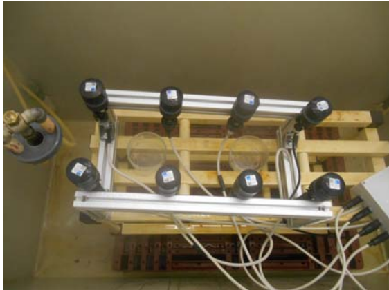
Mist, Fog and Low Cloud Test