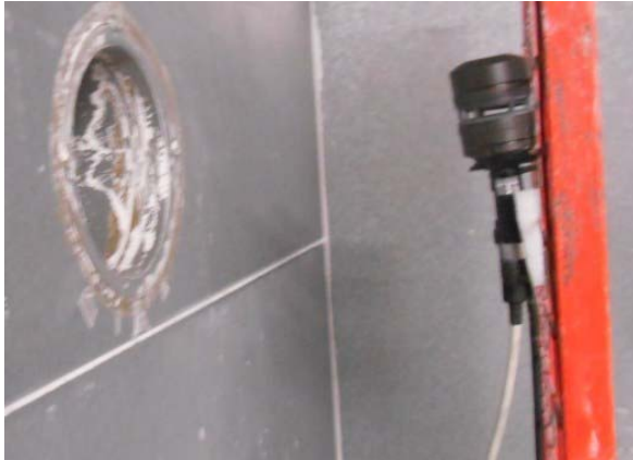
Dust and Sand Test